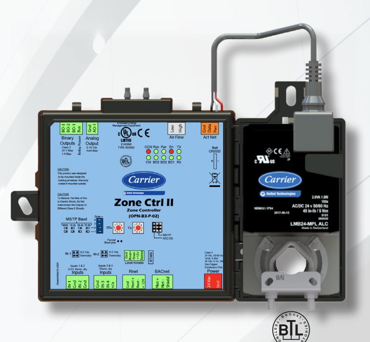
The i-Vu Building Automation System