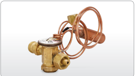
TXV with all threaded connections saves time in the field