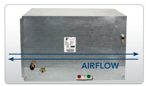
Bi-directional airflow for installation flexibility