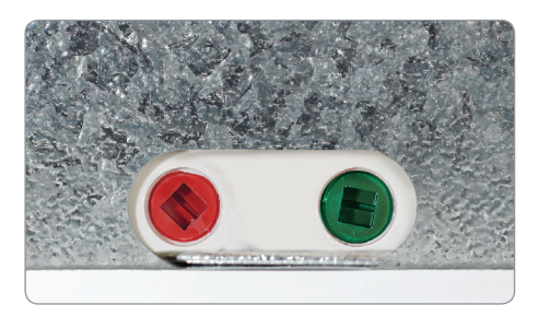
Green & red plugs to identify primary vs. secondary drain connections