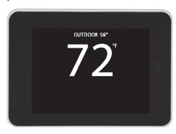
Fig. 1 – Smart Sensor SYSTXZNSMS01

Room Sensor is applied in the same zone, the Remote Room Sensor has temperature priority over the Smart Sensor.