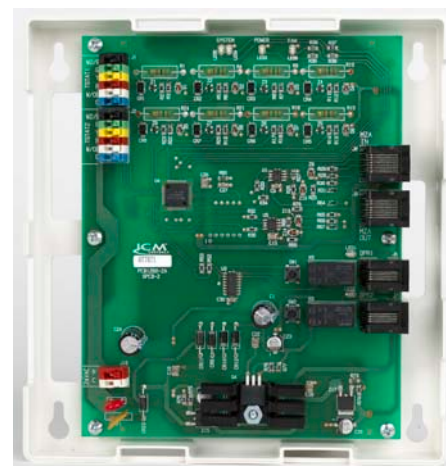
Model MDPA2 Zone-Adder™

Systems Over Three Zones – The MDP3 is a two and three zone only panel and can be added on to by adding the MDPA2. The MDPA2 is a two zone adder control panel. Multiple MDPA2 panels can be wired together in a "daisy chain" connecting one to another with an RJ45 Ethernet Cable, supplied with each MDPA2. A total of 50 – MDPA2 panels can be wired together to get up to 100 Zones additional to the MDP3 for a total of 103 Zones.