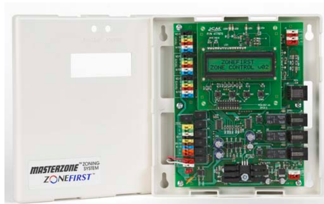
MDP3 Panel Shown with Cover.