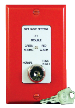
MSR-50RM/R & MSR-50RK/R

The MSR-50R Series indicator/control assemblies provide: