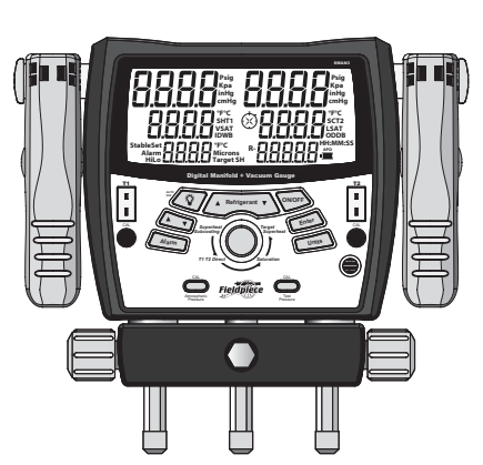
Digital Refrigerant Manifolds