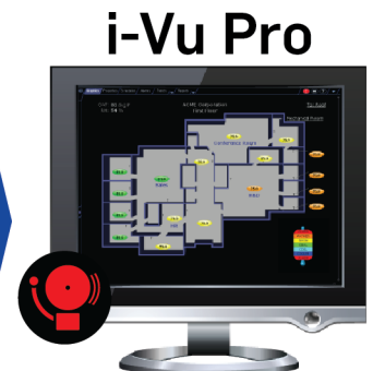
Centralized Alarm Management