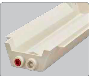
Drain pan designed for low water retention; red plug identifies secondary drain