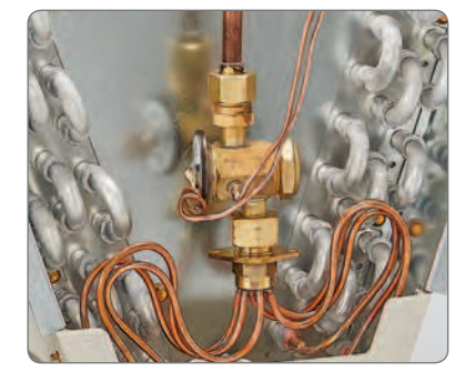
Factory installed TXV with all threaded connections; no brazing required