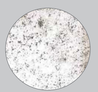
Standard plastic pan with visible mold

Every Healthy Solutions® coil features Microban® technology, providing added protection against the build-up of mold and mildew within your system!